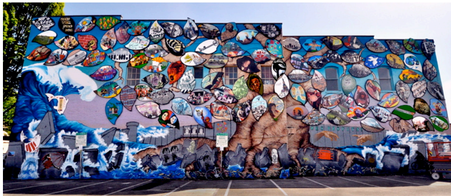
The Olympia-Rafah Solidarity Mural in downtown Olympia represents social movement organizations (from around the city and the world) as “leaves” on a tree.

The list is by no means comprehensive, and can only offer examples of social movement organizations. The Directory can only provide a starting point in researching these extensive social movements in the U.S. and abroad.