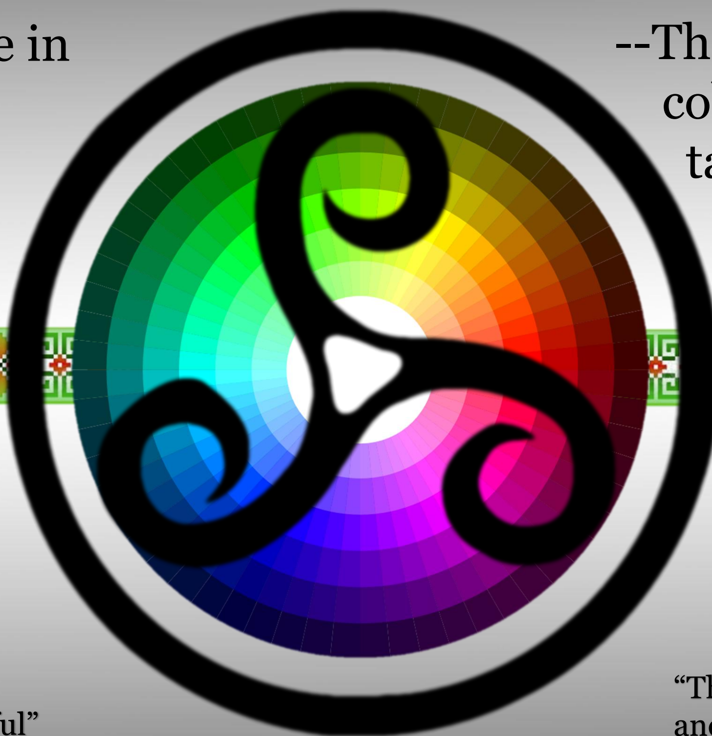
“Vasilisa the Beautiful”

--The importance of color in folk-tales vs visual folk-art.