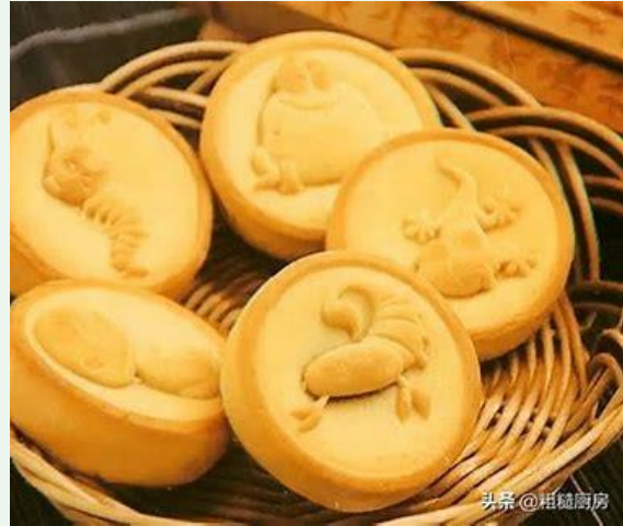
Five Poison Cake

It is the representative food of the Dragon Boat Festival. Tastes vary from place to place, and people in the south prefer salty-tasting zongzi, such as pork belly zongzi and salted egg yolk zongzi. In the north, sweet glutinous rice dumplings are the main, such as jujube glutinous rice dumplings and red bean glutinous rice dumplings.