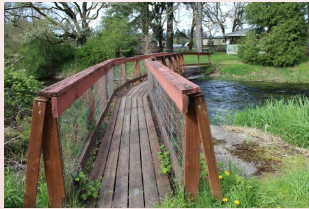
I took this photo April 2017

This creek is in my hometown. It flows from the Nisqually River. I grew up watching the creek routinely dry up and come back to life filled with salmon. Unfortunately water hasn't ran through this creek for many years now. The Roy and neighboring Yelm communities have been working together to restore and preserve this this small town treasure.