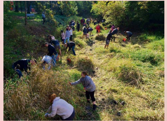
Nisqually Valley News 2024

This creek is in my hometown. It flows from the Nisqually River. I grew up watching the creek routinely dry up and come back to life filled with salmon. Unfortunately water hasn't ran through this creek for many years now. The Roy and neighboring Yelm communities have been working together to restore and preserve this this small town treasure.